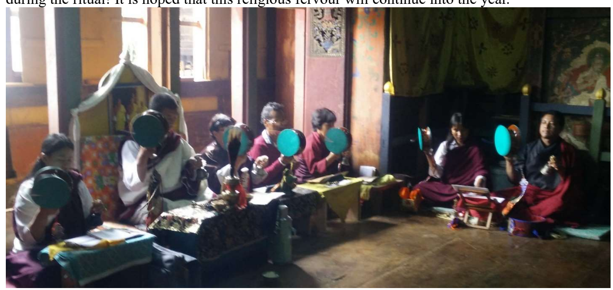
The chöd ritual performed by a group of men and women

The year began with some religious fervour as demonstrated by the performance of the reading of the Bum (Prajnaparamita), which was conducted in February. A few days later a household from the village and the Foundation jointly hosted the ritual of chöd in the Dolma Lhakhang The annual Gonpoi dudchod was performed in June. A group of households in the village hosted another ritual of chöd , performed by 10 lay people, disciples of Dungsey Garab Rinpoche in the Dolma Lhakhang towards end of June. The group comprised of men and women. It was new experience for many, to see women practitioners who had tend to their babies and small children during the ritual! It is hoped that this religious fervour will continue into the year.