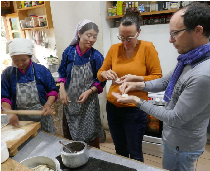
Visitors enjoy momo making lessons