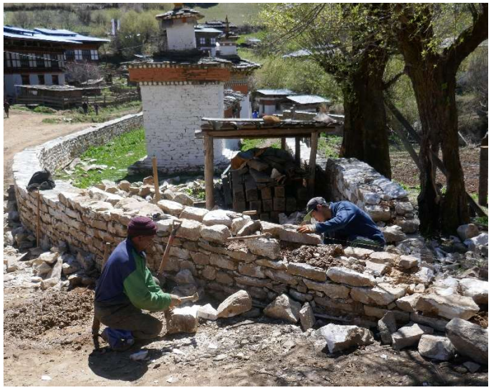
Working on the last few meters of wall

The boundary wall was completed in March. Within the well protected area, around the mani