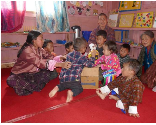
Toys for Bebzur ECCD