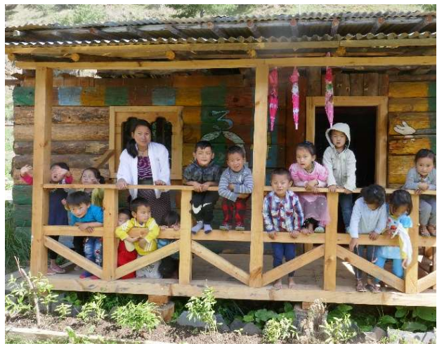
Students of Misethang ECCD