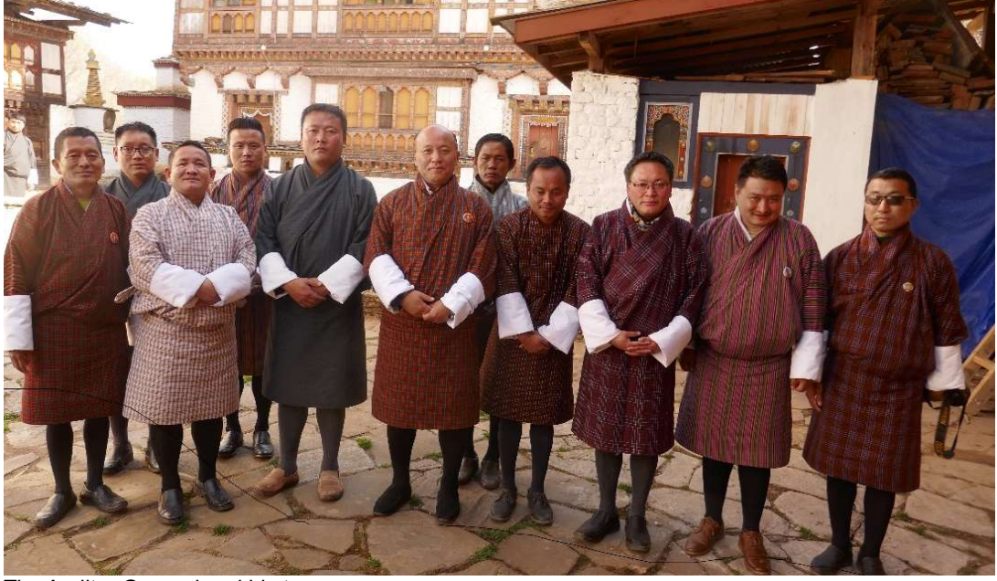
The Auditor General and his team

Coincidentally the Foundation was honoured by a visit by the Auditor General and a team from the Royal Audit Authority almost at the same time as the audit was conducted.